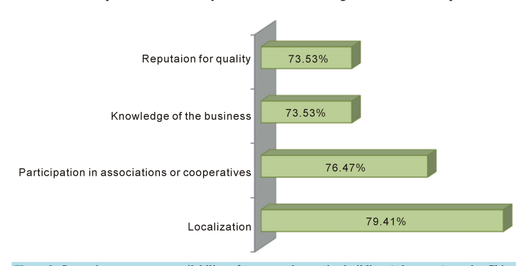
Chart 2. Strategic assessment: availability of assets and capacity building (advantage) on the Chico Mendes Resex, Acre, 2005/2006.

On the one hand, the proposed payment is conditional on the line of family reproduction that represents the minimum remuneration required for the family to cover the costs of goods and services purchased in the mar-