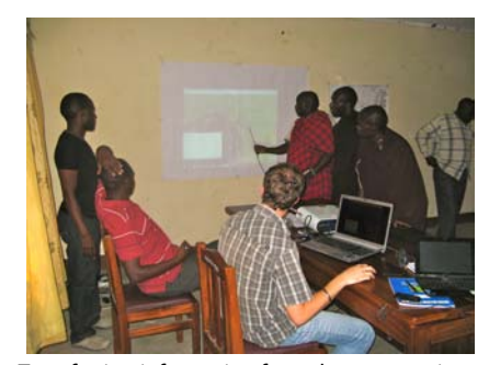
Transferring information from the community perception maps onto Google Earth

2. The sketch is transferred onto paper by participants and/or the 'mapping' team.