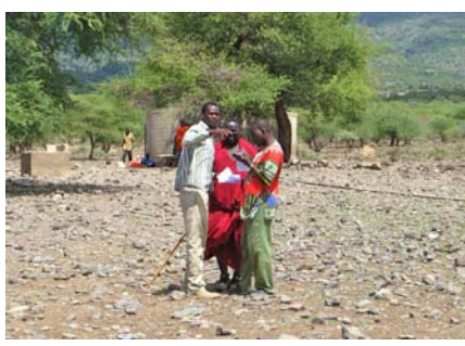
Planning with communities ensures an approach that better supports local livelihoods

The ward level Google Earth maps are combined into one district-wide map and presented for discussion and validation at a series of community meetings from ward to district level. Additional information and further cross-checking of information is carried out before a final map is produced and approved by the full District Council. At this stage, the Google Earth maps are converted into paper maps.