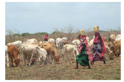
Thousands of pastoralists depend on the Tana Delta for dry season grazing

people has been established as a forum for eliciting the views of local people in the land use planning process. The Committee is made up of four local government and 21 community representatives. Nature Kenya facilitated government officials' visits to 106 villages within the Delta to collect communities' input into the land use plan. Each village drafted a village land use plan, which will feed into the delta-wide plan.