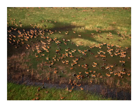
If the migration routes of wildlife can be protected from land acquisition for commercial investment, can routes for livestock be protected too?

Cherie Beyene of the Ethiopian Wildlife Conservation Authority described how EWCA negotiated the return of 25,000 ha of land (previously part of Gambella NP) that had been leased to an Indian investor. Consultations were carried out with the investor, the federal investment bureau and other stakeholders showing the importance of the sites for biodiversity.