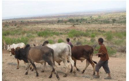
How best to secure and administer communal lands in Ethiopia's pastoral areas is a key question being asked by government.

reflect federal level policies and legislation and the guidance given therein. However though general rural land policy and legislation exists, the federal government has not yet developed policy and legislation specifically for pastoral areas so regional governments are moving forward without these.