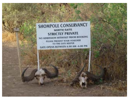
Are Conservancies a tool for protecting both pastoral land rights and natural resources?

In Kenya the opportunities for better securing rights to land for pastoralists (and other rangeland users) through the 2010 Constitution and the development of the Community Land Bill were highlighted by Stephen Moiko. With these more secure rights opportunities exist for developing the Conservancy Model where a community and conservation organisations work together to better manage and conserve natural resources including wildlife, which can then be used for tourism and other enterprises.