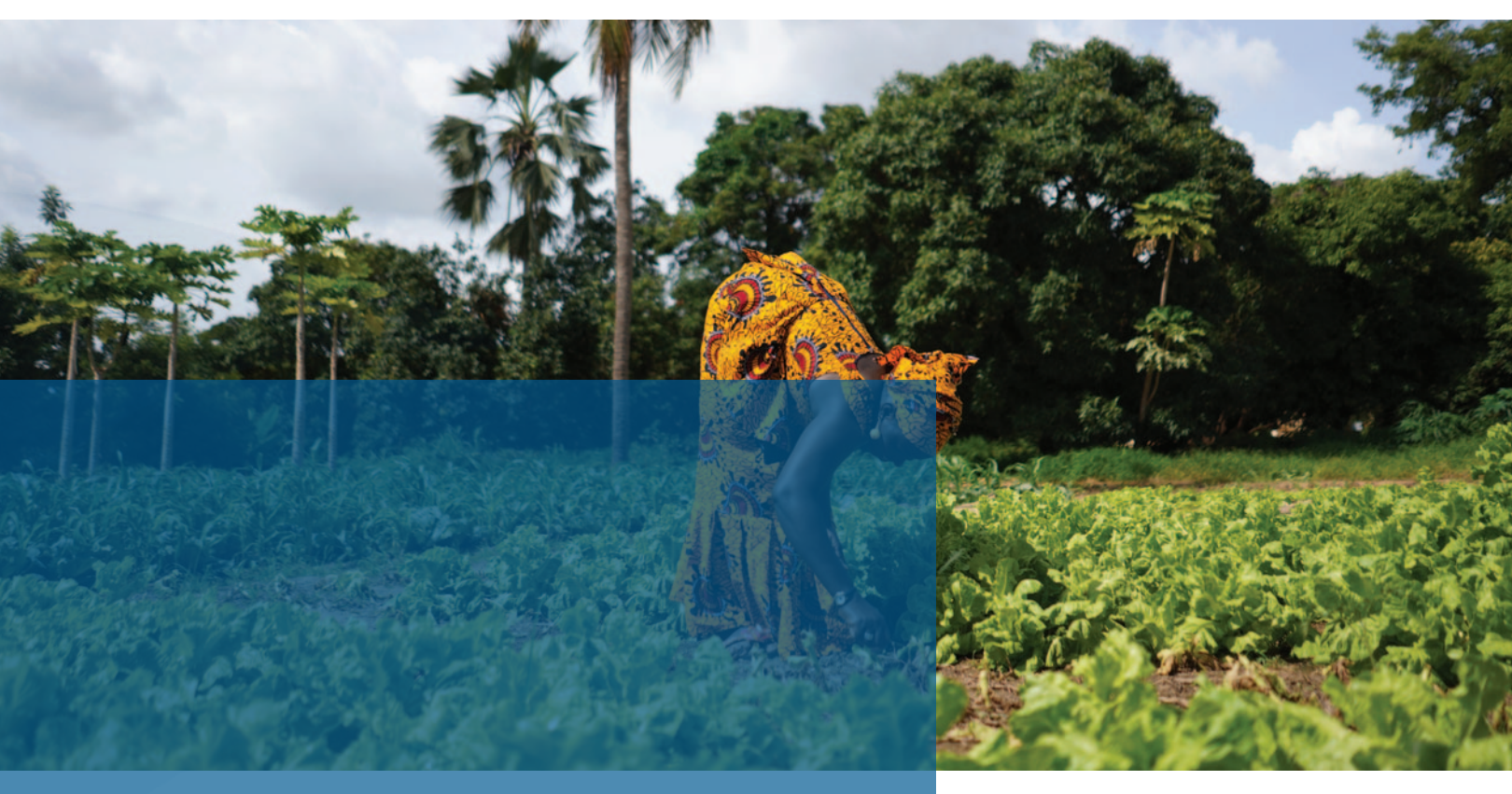
Farm worker, Mali.