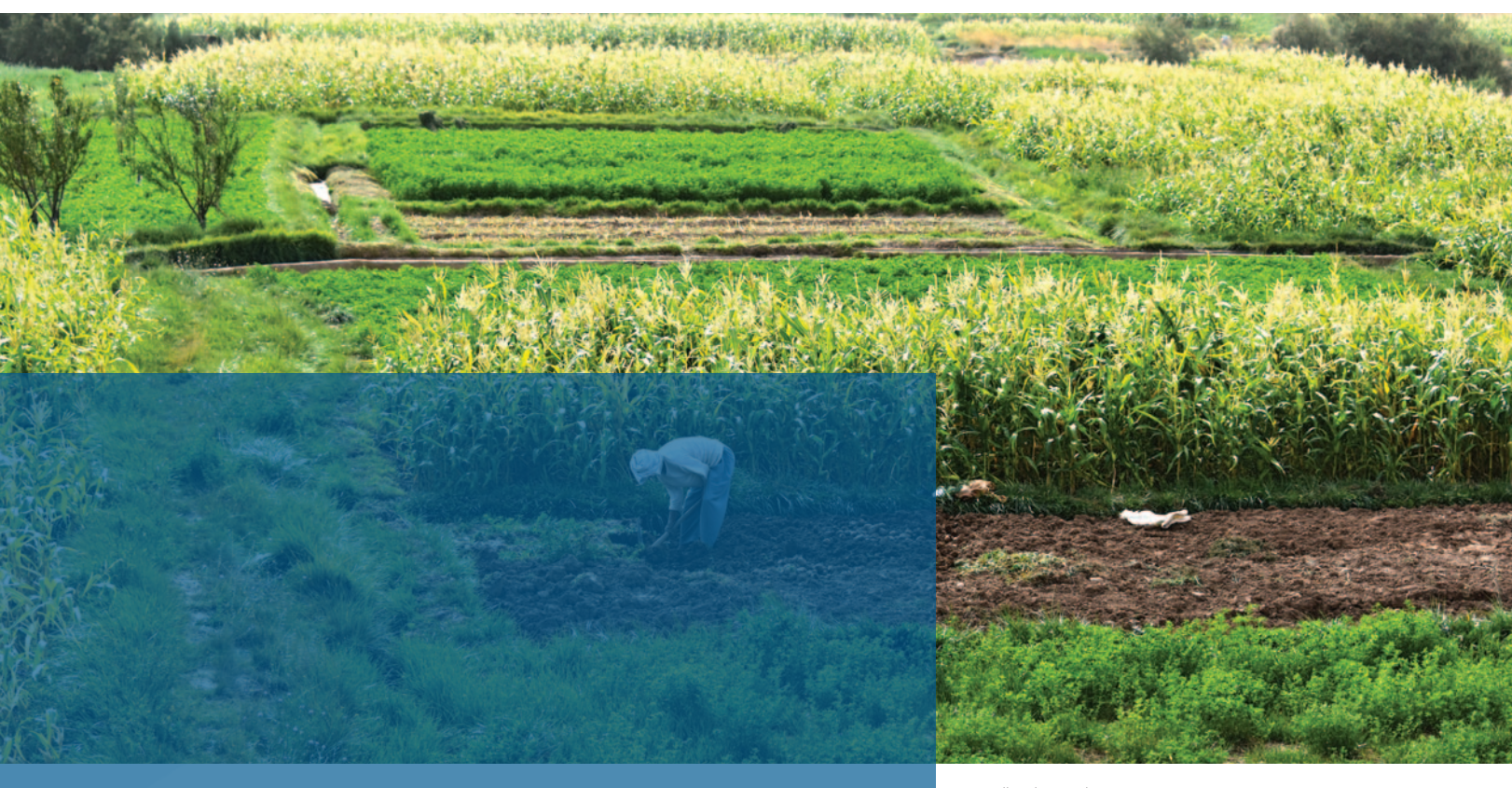
Small-scale agriculture, Morocco.